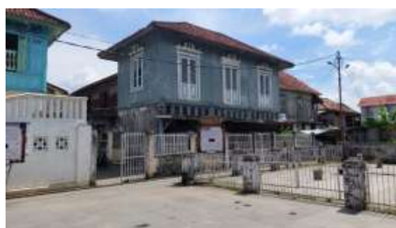
Figure 8. Twin Land Houses (South) of Al-Munawar Village, built in the late 18th century

which is approximately 4 m high and features 50 cm x 50 cm marble tiles imported from Italy. The roof of this house resembles a shield with gentle slopes on all four sides. This house served as a shelter for all residents of Al-Munawar Village during the battle that lasted 5 days and 5 nights on January 1-5, 1947. This is the third house built by Al Habib Abdurrahman Al-Munawar for his third son, Al Habib Ali Al-Munawar.