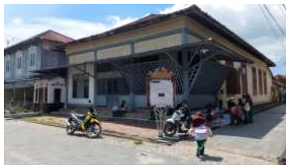
Figure 6. The Land House of Al-Munawwar Village, built in the late 18th century

The open terrace parallel to the front of the house is one of the distinctive features of Indies houses built by Europeans in the archipelago. Uniquely, this house is built in a pillar-like format, while the stairs on the right and left sides adapt the stairs of a pyramid-style house, but are positioned oppositely. Although its roof resembles a pyramid-shaped house, this house does not have multiple floors (Syarofie, 2012). Al Habib Abdurrahman Al-Munawar built this house, which was the first house in the village.