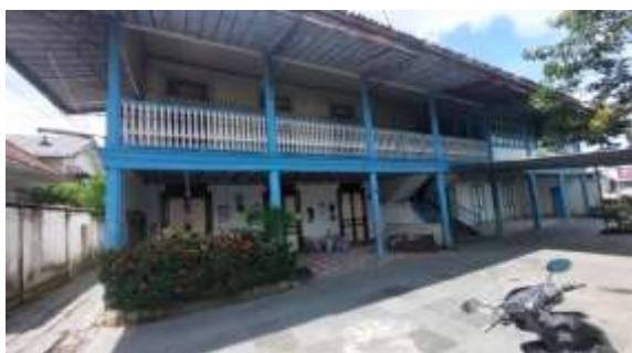
Figure 6. Twin Sea Houses (East) of Al-Munawar Village, built in the late 18th century

The twin sea houses are two structures built adjacent to each other along the Musi River with identical designs, connected by a covered terrace at both the front and rear. The lower part of the house features brick walls, while the upper part is constructed of wooden walls. Both houses were built almost simultaneously and have three sections, both downstairs and upstairs. The lower floor features an open terrace at the front, with a living room and bedroom in the middle, and an open terrace at the rear. At the rear of the building, an additional structure serves as the dining room and kitchen. The upper floor also consists of three sections, with a covered terrace at the front, a bedroom in the middle, and a covered terrace at the rear. The terraces at the front and back also serve as a connection between the two houses.