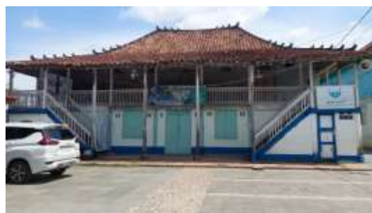
Figure 5. The Tall House of Al Munawar Village, built in the late 17th century

The Arab village of Al-Munawar 13 Ulu, Palembang, also has a "Stilt House" locally called "Rumah Tinggi." This house is over 350 years old, and its current owner is the seventh descendant of the original owner, Syarifah Hasan. The building has two floors; the ground floor is made of stone, while the upper floors are made of wood. The design of the ground floor room is adjusted to the pattern of the room on the upper floor (Triyuly, 2008).