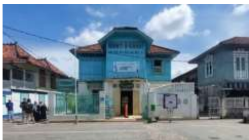
Figure 9. The Glass House of Al-Munawar village, built in the late 18th century

connecting the lower and upper floors. In the center of the lower floor, there is a living room and bedroom. The rear consists of an open terrace, a dining room, a kitchen, and an open space. The upper floor of the house is also divided into three sections. The front is a covered terrace, the middle section houses the bedrooms, and the rear is a covered terrace. The roof of the house is shaped like a cross shield. The construction and structure of this "twin" house are identical, except for the staircase, which is located on the left side to create symmetry with the house opposite. This Land Twin House is the fourth house built by Abdurrahman Al-Munawar, specifically for his fourth son, Al Habib Hasan Al-Munawar.