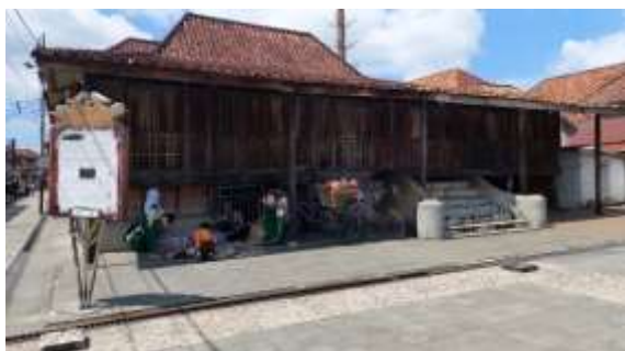
Figure 7. Stone House in Al-Munawar Village, built in the late 18th century

On the upper floor, there's an additional building that serves as a dining room and kitchen (pawon). Rumah Darat is the second house built by Al Habib Abdurrahman Al-Munawar for his son, Al Habib Muhammad Al-Munawar.