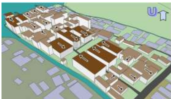
Figure 4. Orientation of Residential Buildings in the Al-Munawar 13 Ulu Arab Village