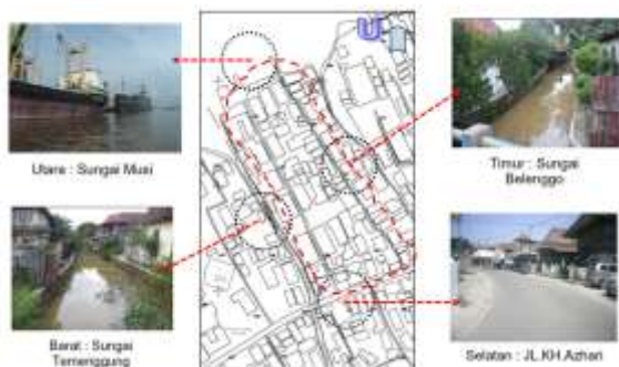
Figure 1. Geographical Location-Al-Munawar 13 Ulu Arab Village Settlement, Palembang

The first person to use the title Al-Munawar was Aqil bin Alwi bin Abdurrahman bin Ali bin Abdullah bin Abu Bakar bin Alwi bin Ahmad bin Abubakar As-Syakran bin Abdurrahman Asseqqaf. The title "Al-Imam Aqil" is derived from the word "Nur" (light), which represents the hope for enlightenment from Allah SWT. The words "Munawar" or "Nawir" describe a steadfast and pious person, often depicting a person with a radiant face and charisma. The combination of these two meanings is reflected in Habib Aqil. This title was passed down to his descendants, each of whom is called Al-Munawar (Yasmin, 2007). Along the Al-Munawar alley are unique old houses. All the houses are large, large enough to accommodate three to six families, and some have even been built with a ground floor and are now occupied.