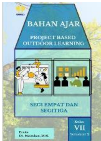
Figure 3. Materials Teaching Cover

be present in the teaching module include school identity and learning, learning objectives, and descriptions of learning activities from the first to the fourth meeting. The initial design of the teaching material is presented in the Figure 3.