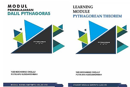
Figure 1. Pythagorean theorem learning module cover

This module is designed to fulfill the basic competencies of explaining, proving and solving problems related to the Pythagorean theorem and Pythagorean triples. The material in this module has been prepared in accordance with the basic competencies to be achieved. It's just that the section on solving everyday problems related to the Pythagorean theorem and triple has not been given examples of problems and how to solve them. The problem solving given in this module is directly in the form of practice questions.