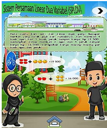
Figure 3. Before revise on-off button on music

sound or turn off the sound while studying as shown in Figure 3 (before the revision) and Figure 4 (after the revision).