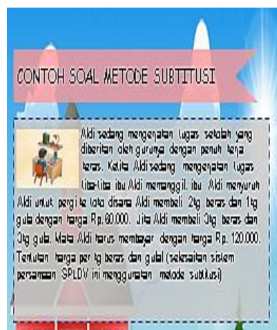
Figure 1. Before Revision of Sample Questions

Material experts provide an assessment from the feasibility aspects of content, presentation, language, and character assessment. The validation results from three experts obtained an average of 87.73% with very valid criteria, then media is feasible. This mobile learning can be used after revision. The suggestions given by experts are that there is a revision in the example of a two-variable system of linear equations. According to validator II, the question is not in accordance with the daily contextual context of junior high school students as shown in Figure 1 (before the revision) and Figure 2 after the revision.