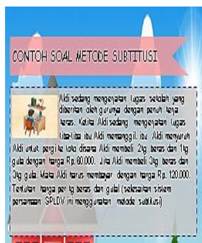
Figure 2. After Revision of Sample Questions