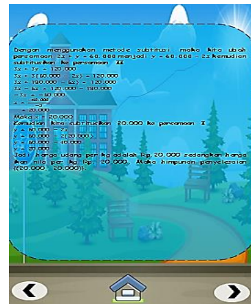
Figure 5. Before revision of media display revision

6). The full results of expert validation can be seen in table 2.