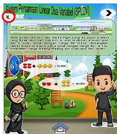
Figure 4. After revise on-off button on music

6). The full results of expert validation can be seen in table 2.