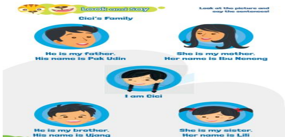
Figure 2. The example of VL activity

Table 3 above shows that 74.62% of the total activities in the selected units are aimed at stimulating students’ verbal/linguistic intelligence. Almost all the activities in each unit are used to develop students’ language skills. A sample of activities that employed verbal/linguistics intelligence is activity 1, Look and Say , from unit 6 in My Next Words textbook for second grade.