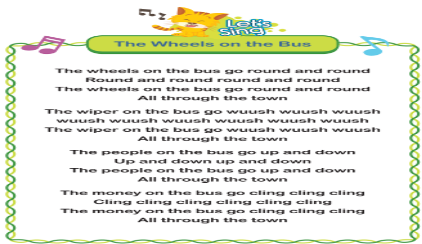
Figure 5. The example of M activity

Musical is the least intelligence catered to the activities in the selected units, with 2.98% of the total activities. Table 2 shows that only two out of eight selected units include activities catering to students with musical intelligence. The musical activity incorporated in both units is singing a song at the beginning of the class activities. An example of musical activity is Activity 1, Let's Sing , from unit 11 in My Next Words for fourth grade.