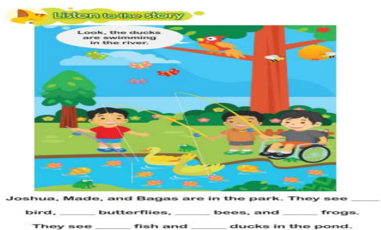
Figure 8. The example of N activity

Table 3 presents that 11.34% of the activities in the selected units accommodate students with naturalist intelligence. It can be observed in Table 2 that half of the selected units incorporate naturalist activities. The highest frequency of occurrences is in unit 9 of the first-grade textbook, with eight activities. This is because the unit specifically discusses animals. An example of naturalist activity in this unit is activity 8, Listen to the Story, in which students are asked to listen to the Story read by the teacher and then identify the animals based on the picture provided in students’ textbook (EYLC Team, 2021).