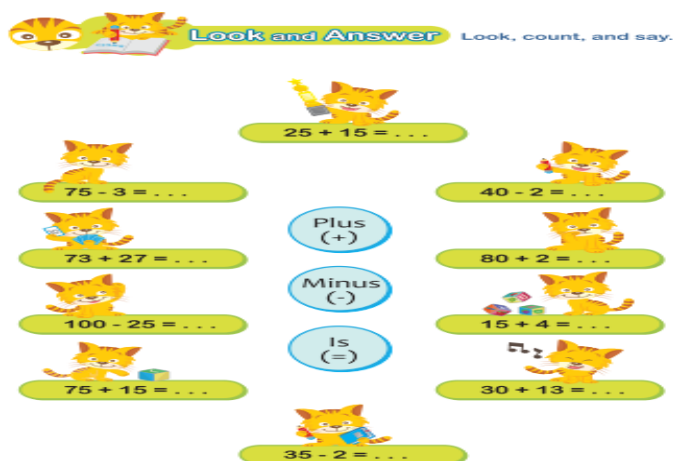
Figure 3. The example of LM activity

Based on Table 3, 22.38% of the total activities in the selected units accommodate students with logical-mathematical intelligence. It can be observed in Table 2 that Unit 6 of the second-grade textbook and Unit 11 of the fourth-grade textbook do not include logical/mathematical activities. The highest frequency of Logical/Mathematical activities among all selected units is unit 2 in My Next Words for fourth grade. It is because students specifically learn to identify numbers and count in English in this unit. A sample of an activity that caters to logical-mathematical intelligence in this unit is activity 2, Look and Answer .