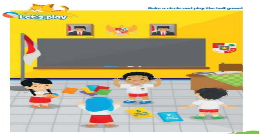
Figure 4. The example of BK activity

body to learn. An example of an activity that accommodates students with bodily-kinesthetic intelligence is Activity 4, Let's Play , on page 5.