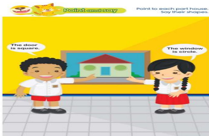
Figure 9. The example of VS activity

Table 3 shows that 73.13% of the total activities in the chosen units accommodate students with visual-spatial intelligence. Table 2 shows that all selected units incorporated visual-spatial activities. The highest frequency of occurrence is in unit 7 of the first-grade textbook, with all the activities accommodating visual-spatial learners. An example of visual/spatial activity is activity 4, Point and Say, in this unit, which requires students to move around the school or class and observe the shapes of things (EYLC Team, 2021).