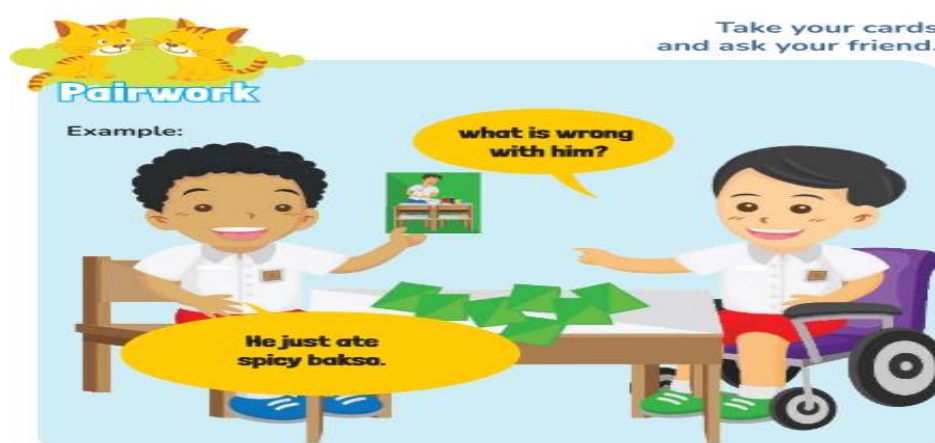
Figure 6. An example of IP activity

Table 3 shows that 13.43% of the total activities in the selected units accommodate students with interpersonal intelligence. It can be observed in Table 2 that five out of eight selected units include interpersonal activities. All interpersonal activities in the selected units are group activities such as games, dialogue, and surveys, which require students to interact with their peers. An example of interpersonal activity is activity 5, Pair-work, from unit 4 in My Next Words for fifth grade.